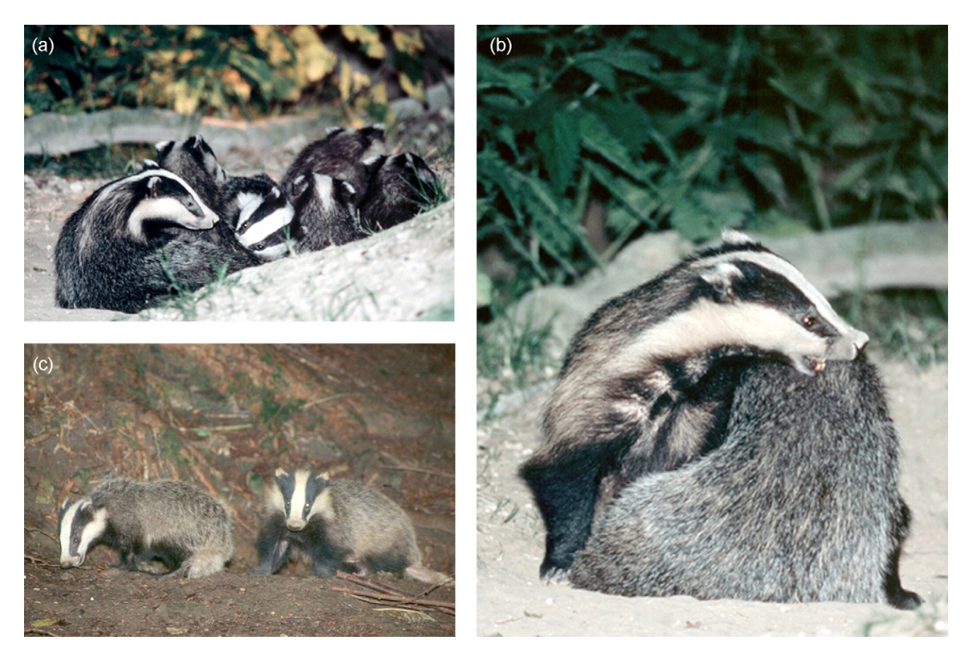
Figure 1 European badgers (Meles meles). In populations undisturbed by culling, badgers are highly social; disruption of this social behaviour is thought to lead to expanded ranging, and increased disease transmission both among badgers and from badgers to cattle.

Analyses adjust for triplet, number of baseline herds, and historic TB incidence (over three years). Results are split by cull sequence duringtrial and by year post-trial and include breakdowns from the initial cull to 6 January 2008. During-trial results include all confirmed breakdowns in the period from completion of the initial proactive cull (in each triplet) to one year after the last proactive cull (in each triplet) and use the January 2007 data download as reported in the ISG Final Report. The post-trial results include all reported confirmed breakdowns from one year after the last proactive cull (in each triplet) to 6 January 2008 and use the download from 6 January 2008. All results are based on locations from the VetNet database.